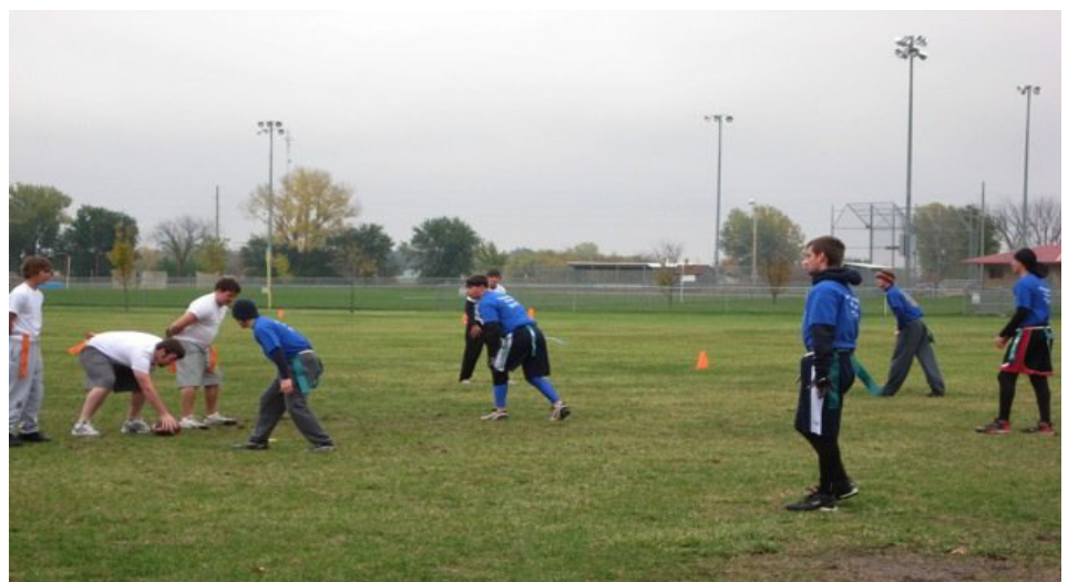
Phi Delta Theta members compete in a flag football game against Tau Kappa Epsilon this fall. The team ended the year 5-1.

We plan on continuing our flag football and basketball teams into the spring semester.