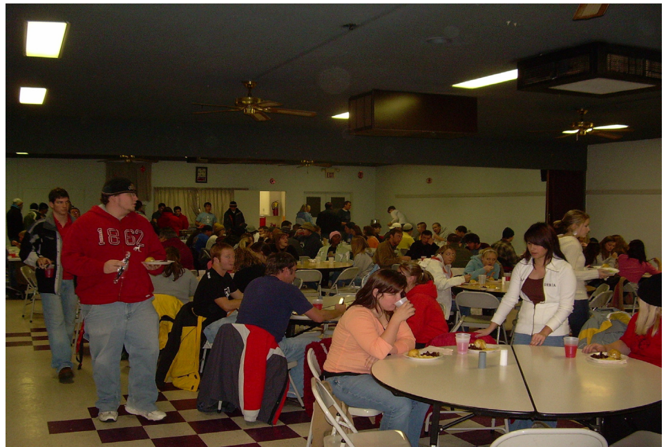
Just under 200 members of the USD community showed up in support of the annual SDA chislic feed.

Since the chapter did such a great job with these events we have been directly contacted by another organization to participate in the Relay for Life in January. Our good deeds are not going unnoticed! They even requested for one of our members